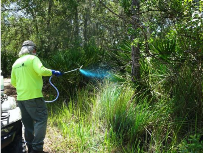
Walk way from Club house to Locksle Ct